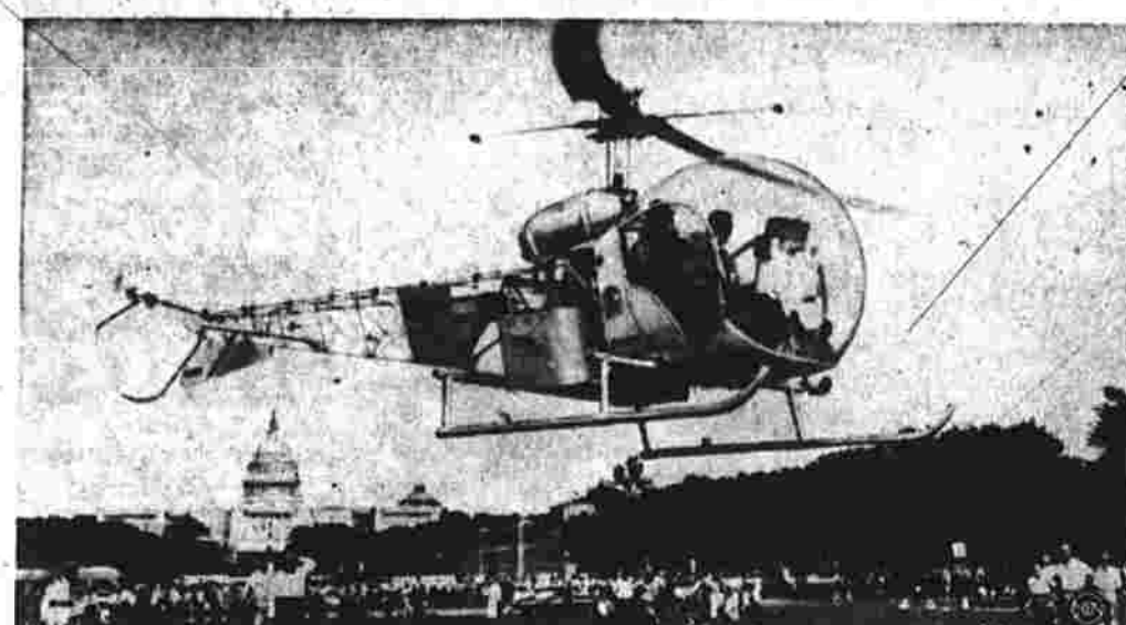
Airborne police in Washington use the helicopter to unravel traffic snarls. Along with other forms of aircraft, it's also one of today's most important crime fighting weapons.

long stretches of highway where the danger of capturing armed, desperate criminals. Once two fugitives were reported making a getaway along a beach covered with high sand dunes. The FBI figured there was a good chance the men might abandon their car and hide out among the dunes. Any agent who entered the area would risk being ambushed. A helicopter solved the problem. An agent located the fleeing automobile from the air and gave chase. In trying to out-manuever the plane, the fugitives lost the safety of the beach. They were captured a short time later at a police road block. Another use of planes is in gun down fugitives concealed in places like swamps or thick woods. Many times criminals won't leave their hiding places for fear of being spotted from the air. This gives the ground forces a chance to reach the scene. At the same time, the airborne agent can study the area's layout and relay the information to the lawmen for use in mapping out their plan of attack. Tomato Mix Developed Washington, Dec. 20 (AP) — A new tomato powder has been developed for use in sauces, soups, dry mixes and juices. The powder is said to mix with water and it can be stored in its powder form indefinitely without refrigeration.