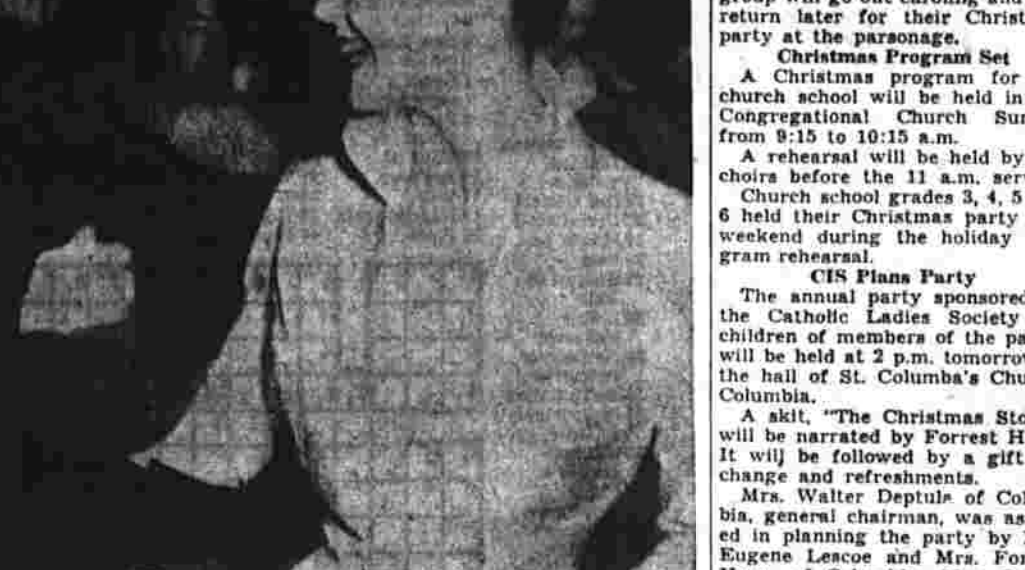
All Eyes on Crosby Bing Crosby and his bride of a few weeks the former Kathy Grant, are the center of attention as they arrive last night for the premiere of "The Bridge on the River Kwai." It was the new bride's first appearance at a Hollywood function since her surprise wedding in Las Vegas last October.